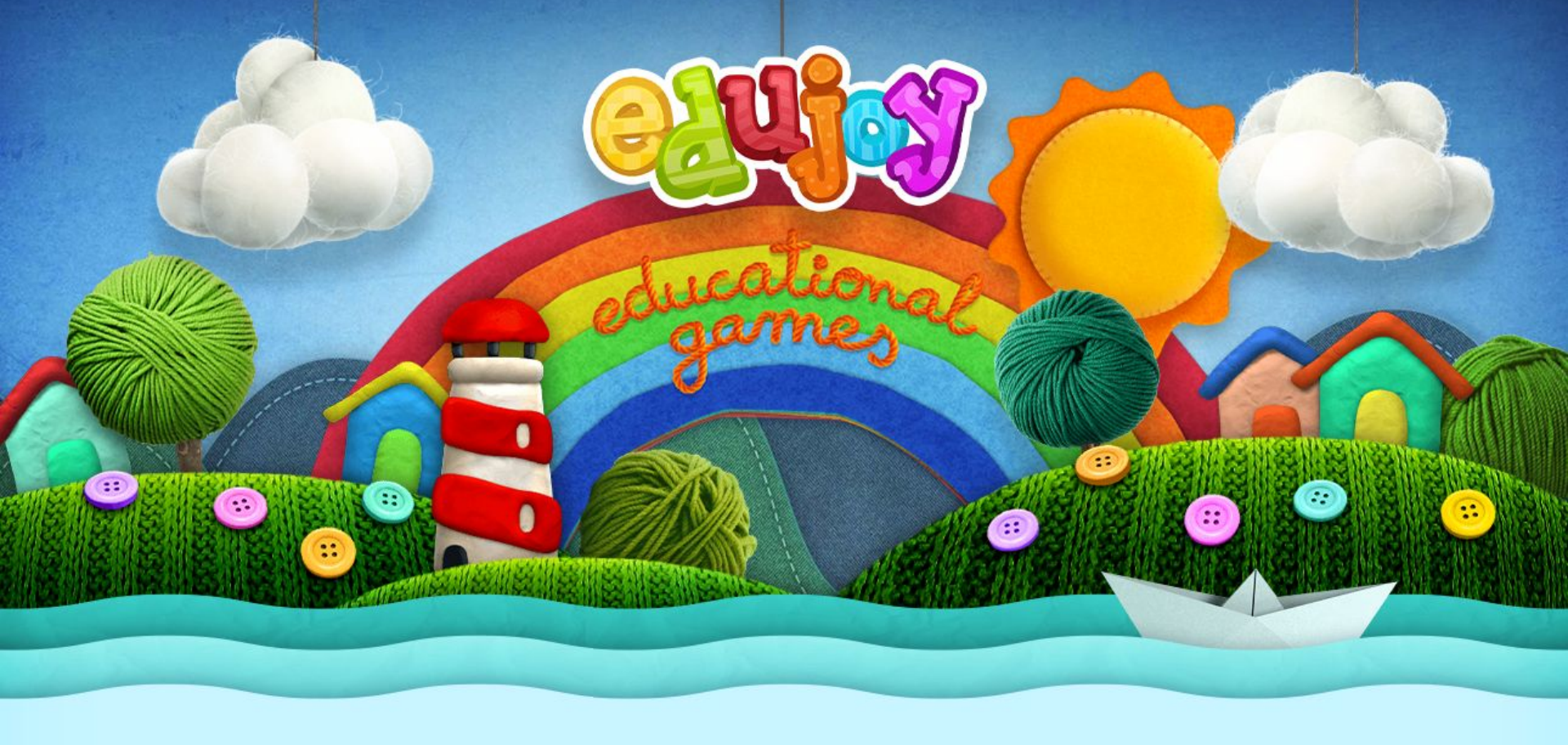
An enjoyable learning experience